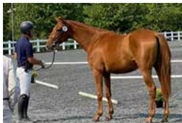
Magnific Coco Chanel is the 2022 FEH National High Scoring Two-Year-Old.