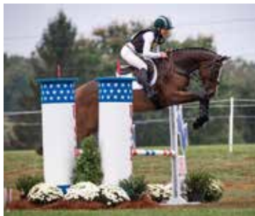
Union City is the 2022 East Coast YEH Four-Year-Old Reserve Champion and US Event Horse Futurity Champion.