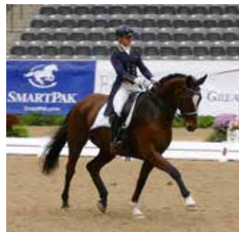
Qennett HTF eaned the Intermediate I Reserve Championship at the U.S. Dressage Finals. He also placed third in the Intermediate Freestyle.