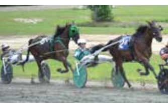
Harness Racing Outside of Ocean Downs and Rosecroft Raceway, Harness Racing in Maryland takes place at The Great Pocomok and The Great Frederick fairs.