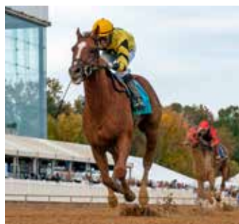
Thoroughbred Racing Ournationonparade won the 2022 Maryland Million Classic at Laurel Park this past October.