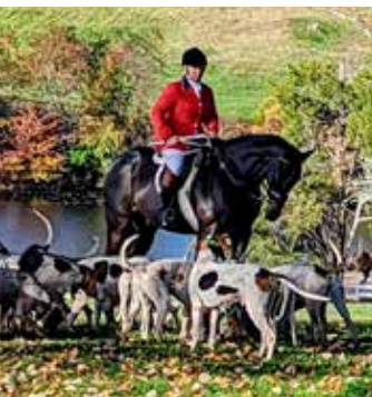
Foxchasing De La Brooke Foxhounds is one of nine recognized packs in Maryland.