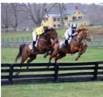
Steeplechase Maryland offers both National Steeplechase Association sanctioned races and local Point-to-Point races like the one hosted here by Elkridge-Harford Hunt Club at Atlanta Hall Farm in Monkton