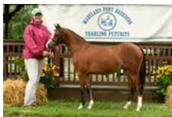
Breed Shows The Welsh filly Covenant Freedom Song was the 2022 Maryland Pony Breeders Yearling Futurity Grand Champion.